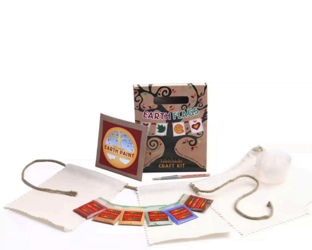
Earth Flags Craft Kit

ACE Member: $10 Non-Member: $12 $5 for youth (age 18 or younger)