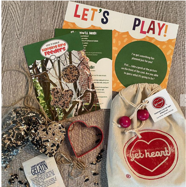
Bird “Let’s Play!” Kit

Create your own heart-shaped bird feeder using this kit and enjoy several fun activities in the process!