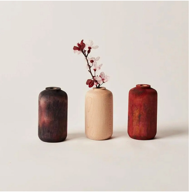
Tie Dye Vase Kit: Midnight (Age 14+)

Create your own watercolor vase using one of our tie-dye kits! This kit teaches you how to make your own watercolor vase using ice and the tools provided. It’s a fun, easy-to-learn project for the entire family. Vase, dye, basket, dye fixers, and safety gloves are included. Kit also contains extra dye and fixers so you can tie-dye other items!