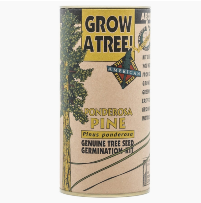
Ponderosa Pine Seed Grow Kit

This fascinating kit, with its enchanting dinosaur-themed packaging, brings a smile as well as everything needed to germinate and grow a tree that has existed on our planet for hundreds of millions of years!