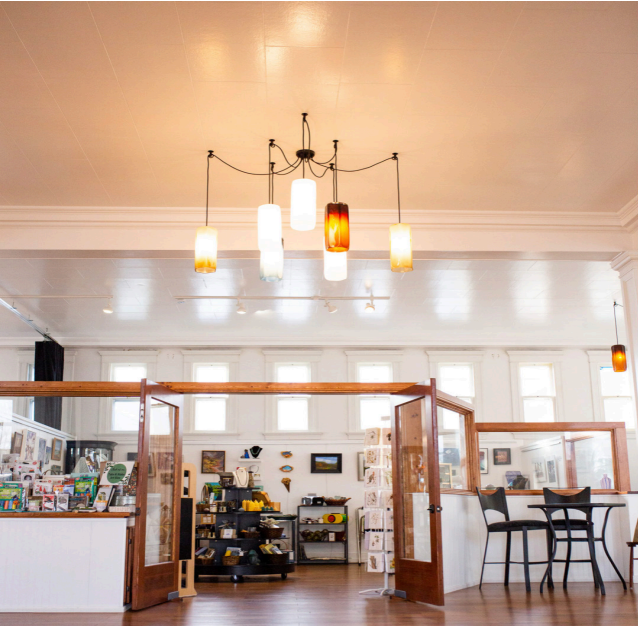
Art Center East Gift Gallery

The Art Center East Gift Gallery offers a curated selection of fine art and functional handmade goods by more than 75 local, regional, and international artists: greeting cards, original paintings, prints, blown and fused glass pieces, jewelry, ceramics, textiles and much more. The ACE Gift Gallery also carries a selection of curated Take & Make Art Kits. There is something for everyone and new inventory arrives monthly!