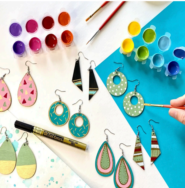
DIY Earrings Kit (Age 10+)

Wildflower Art Studio’s DIY Earrings Kit makes a fabulous gift! Packaged in an adorable gift box, each kit includes everything you need to create five fabulous pairs of earrings: a few to wear, a few to share!