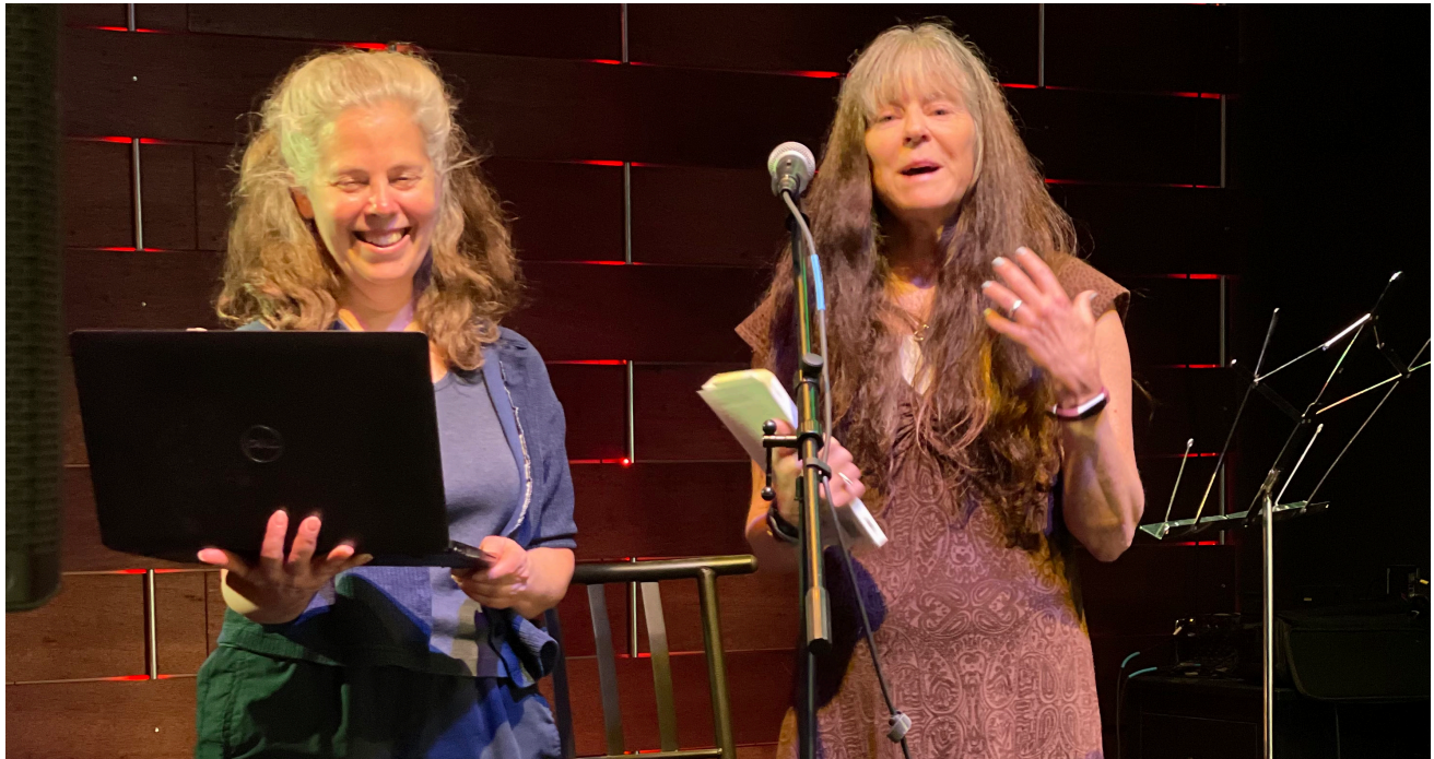
ACE Writing Project at HQ (2022)