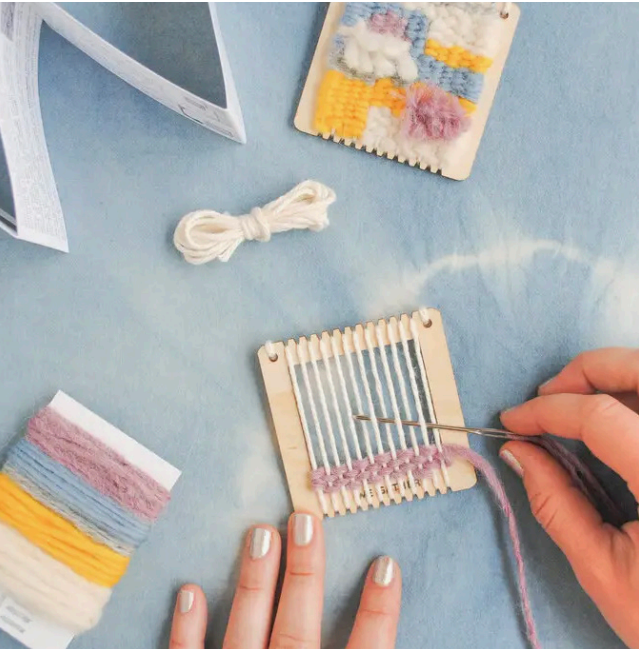
Lil Loom Weaving Kit (Age 8+)

ACE Member: $15 Non-Member: $18 $10 for youth (age 18 or younger)