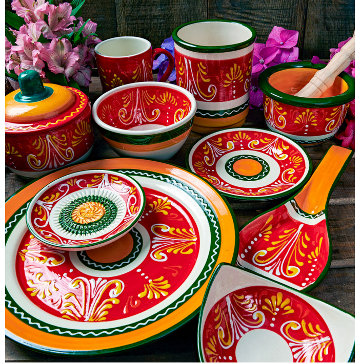
The Toledo Range

Hand-painted ceramics in the traditional style of the Granada region.