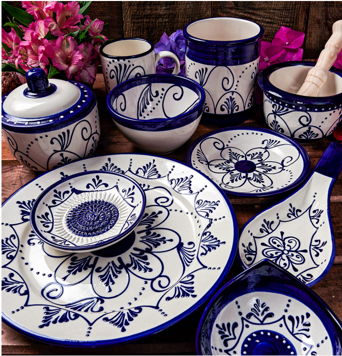
The Granada Range

Hand-painted ceramics in the traditional style of the Granada region.