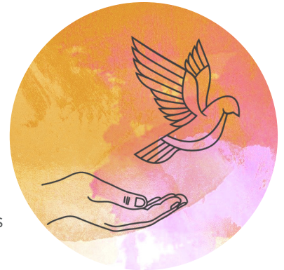
RELEASING GOD'S BLESSINGS

We often think of blessings as things we receive. While it is true that God, by grace, freely gives us all that we have, we are not just passive recipients of God's blessings! Just as God blesses us through people in our lives, so does God promise to bless others through us. When we live from a place of gratitude for God's gifts and trust in God's provision, we can be agents of God's blessing in our world. This November at Hamline Church we celebrate the opportunity to bless our church and our greater world when we share God's blessings. This November we celebrate the opportunity to bless others with the sharing of our gifts and resources, and we want you to know that Because of You, Our Church Changes Lives.