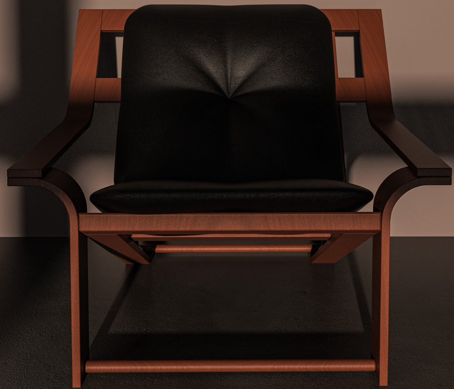
Iretomide Olayeye PORTFOLIO '24