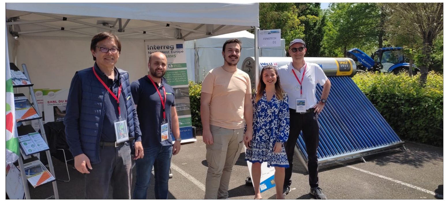
Team members from FengTech, AC3A and LMT at the Make Energy Convention, in Laval in June 2023