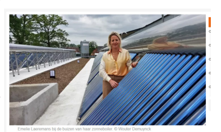
Kalverbedrijf in Herselt neemt innovatieve zonneboiler, uniek in België, in gebruik: "Hiermee kunnen we zo'n 80 procent van de kalvermelk verwarmen"

Follow us on our social media channels below to find more information about these events closer to the date.