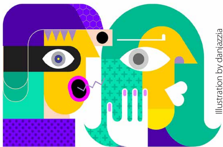
Illustration by danjazzia

What do you think? Do you think this will lower tobacco consumption in our country? Who will benefit from all of this? Do you think anyone will be affected?