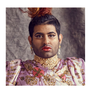
ALOK (they/them) Author, performer, & media personality