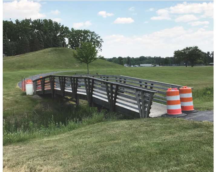
A Ralph C. Wilson Jr. Trails Maintenance Fund grant is helping East China Township resurface its portion of the Bridge to Bay Trail and comply with the Americans with Disabilities Act.

The Bridge to Bay Trail extends along 50 miles of shoreline in St. Clair County, down to the border of Macomb County, including a seven-mile strip in East China Township. The work