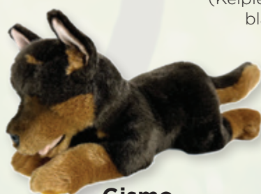
Gismo (Kelpie, 28cm floppy)