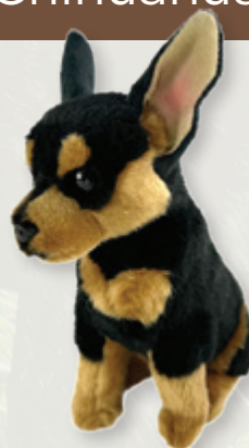
Taco (Chihuahua, 25cm sitting)