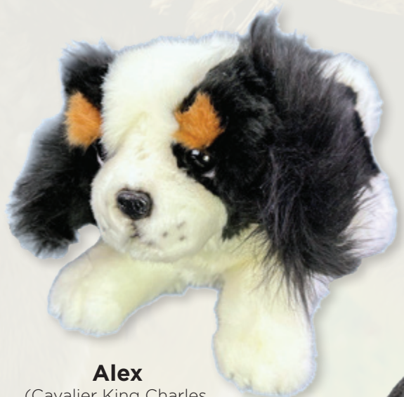
Alex (Cavalier King Charles, 28cm floppy)