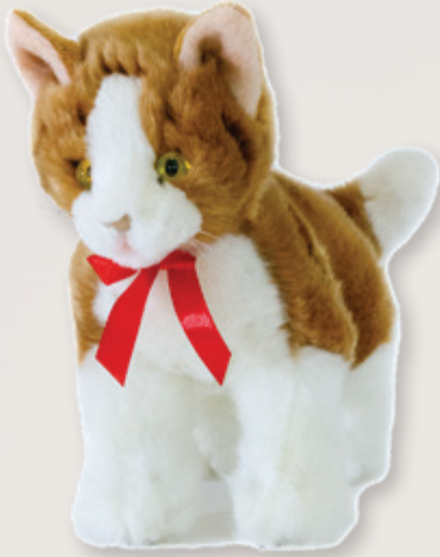
Ginger (Kitten Tabby, 22cm floppy)