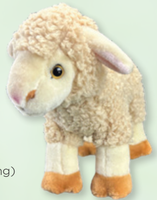
Barbarella (Sheep, 22cm standing)