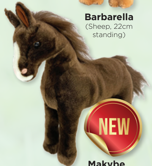
Makybe (Arabian Horse, 32cm)