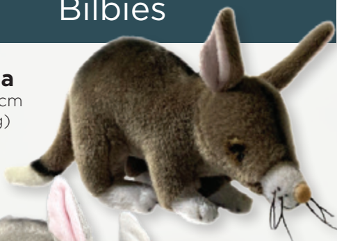
Belinda (Bilby, 20cm standing)