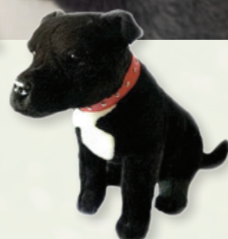
DJ (32cm sitting, black)