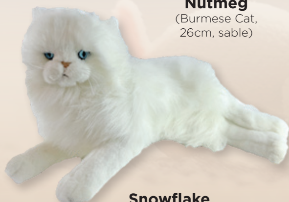
Snowflake (Persian Cat, 38cm lying, white)