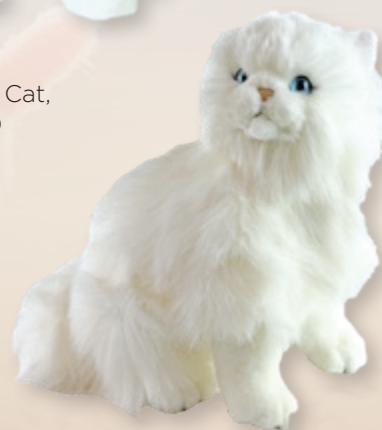
Pearl (Persian Cat, 34cm sitting, white)