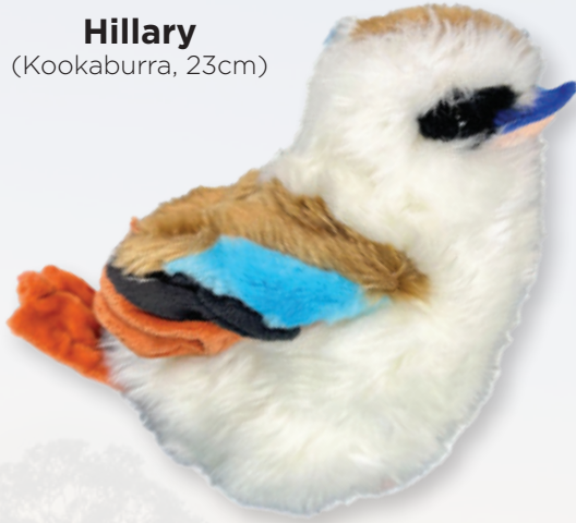
Hillary (Kookaburra, 23cm)