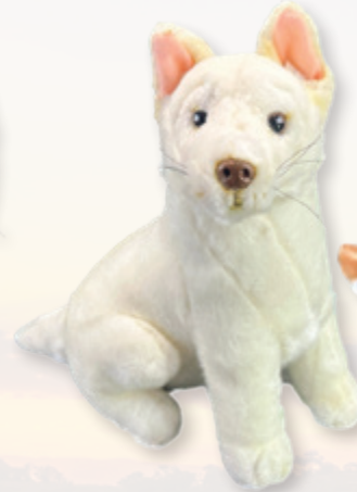
Ivory (Dingo, 25cm sitting, white)