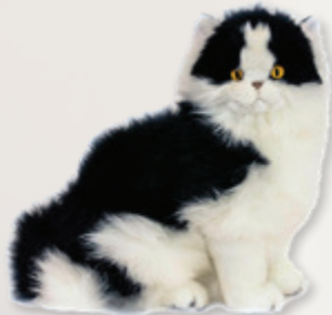
Angus (Piebald Cat, 34cm, black & white)