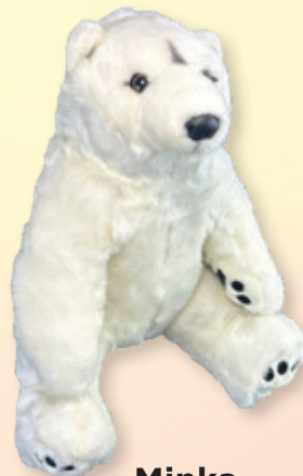
Minka (Polar Bear, 30cm, sitting)