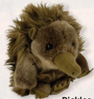
Pickles (Baby Echidna, 13cm)