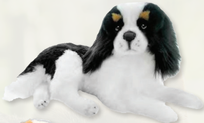
Snuggles (Cavalier King Charles, 40cm)