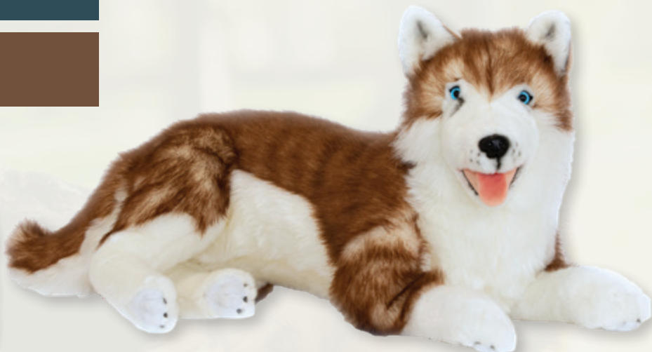
Scarlet (Husky - 62cm lying, red)