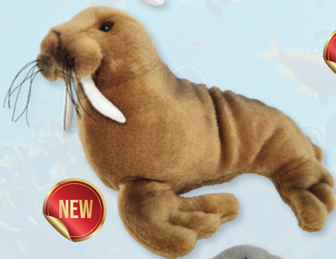
Leopold (Walrus, 28cm)