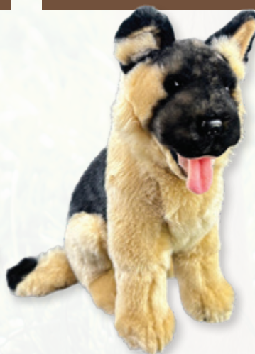
Bobby (German Shepherd, 30cm)