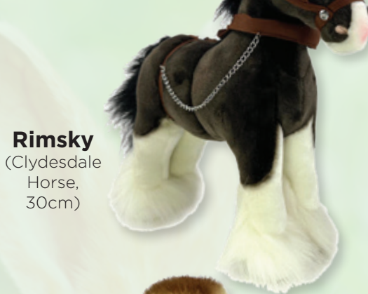
Rimsky (Clydesdale Horse, 30cm)