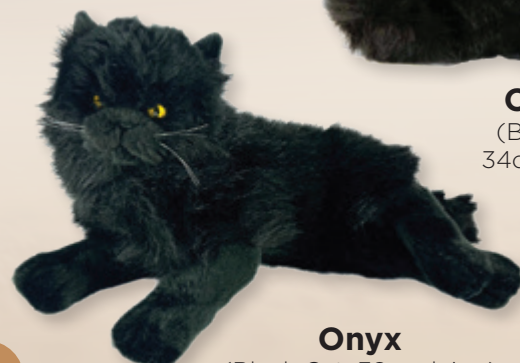
Onyx (Black Cat, 38cm lying)