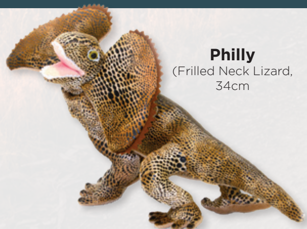
Philly (Frilled Neck Lizard, 34cm)