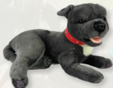
Flint (Staffy, 35cm lying, grey)