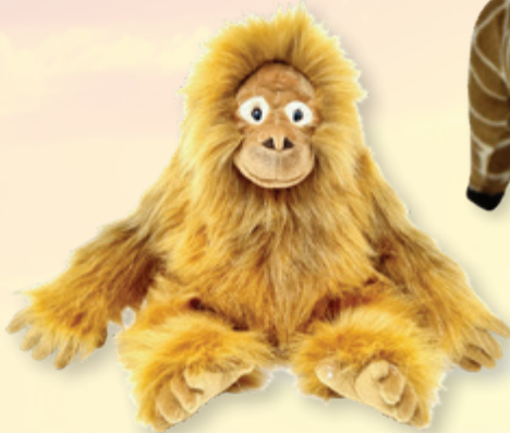
Cha-Cha (Orangutan, 35cm)