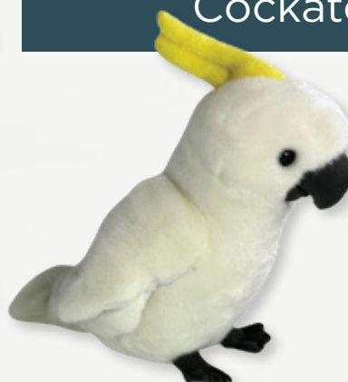
Hector (Cockatoo, 25cm)