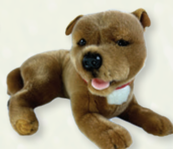
Merlot (Staffy, 35cm lying, brown)