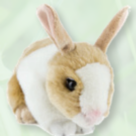
Mopsy (Bunny, 25cm, brown & white)