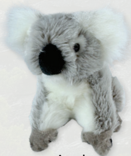
Angel (Koala, 12cm sitting)