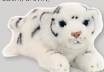
Sheba (Tiger Cub, 31cm, white)