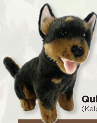
Quinn (Kelpie, 22cm, sitting)