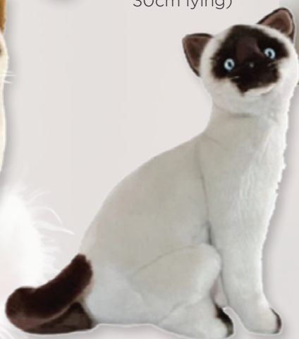
Tulip (Siamese Cat, 36cm sitting)