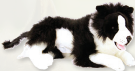
Blitz (Border Collie, 62cm)