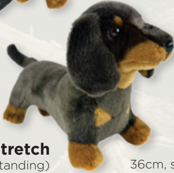
Stretch (Dachshund, 36cm, standing)