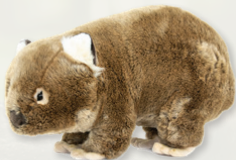
Wallis (Wombat, 55cm)