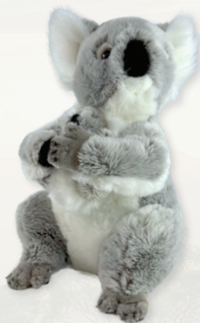
Willow (Koala with baby, 38cm)