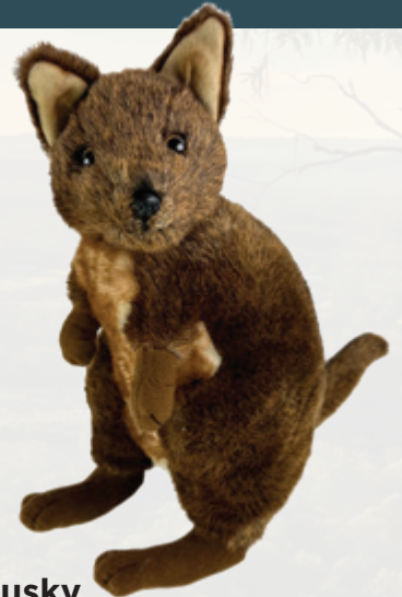
Dusky (Pademelon, 27cm)