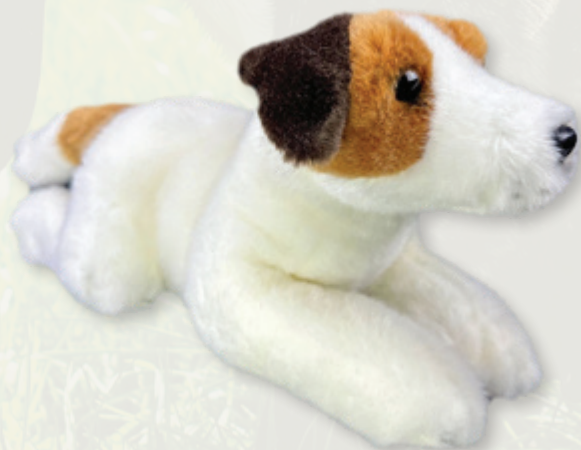
Sparky (Jack Russell, 28cm floppy)