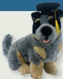
Bluey (Cattle Dog)