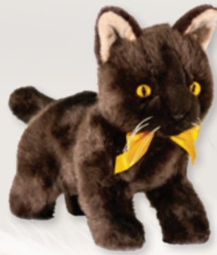
Trixie (Kitten Burmese, 22cm floppy)