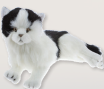
Woodrow (Piebald, 38cm, black & white)