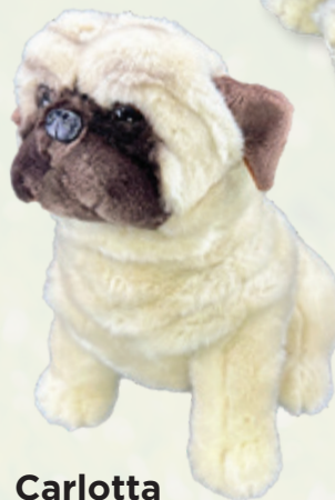
Carlotta (Pug, 28cm sitting)