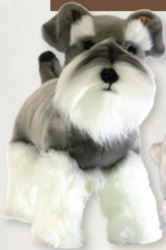
Sherlock (Schnauzer, 35cm standing)