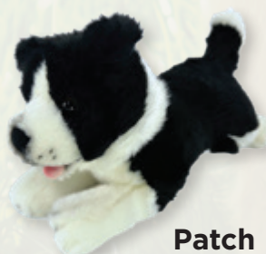
Patch (Border Collie, 28cm floppy)