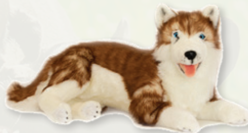
Cade (Husky, 62cm)