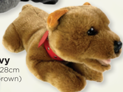
Gravy (Staffy, 28cm floppy, brown)