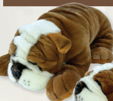
Boston (Bulldog, 35cm lying)