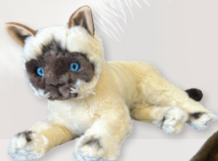
Mia (Burmese Cat, 30cm lying)