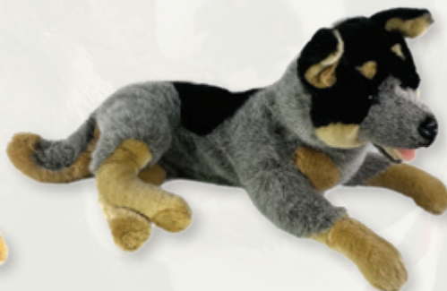
Diesel (Cattle Dog, 62cm)