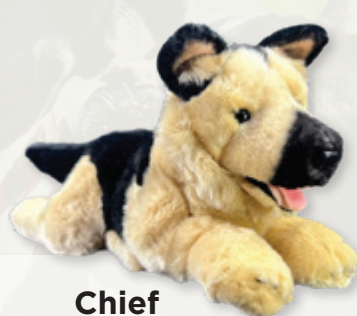
Chief (German Shepherd, 28cm)