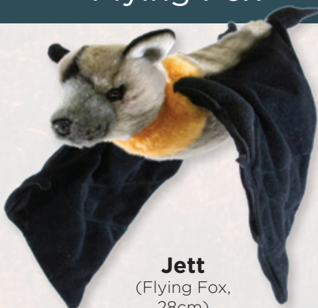
Jett (Flying Fox, 28cm)