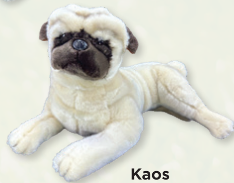
Kaos (Pug, 44cm lying)