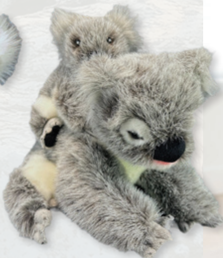
Kelly & Kiri (Koala w baby on back 23cm)