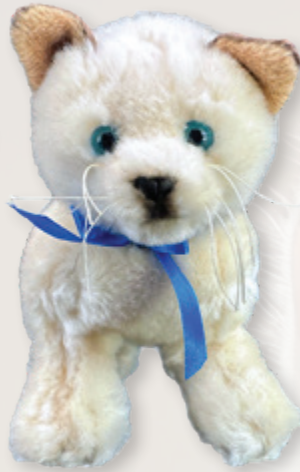
Bamboo (Kitten Siamese, 22cm floppy)