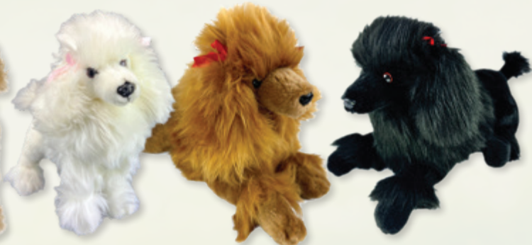
Fifi (poodle, white, 28cm standing)