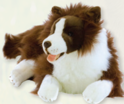
Fudge (Border Collie, 62cm, choc)