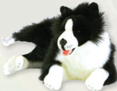
Oscar (Border Collie, 62cm lying)