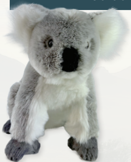
Betsy (Koala, 28cm sitting)