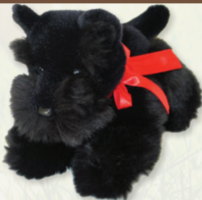
Haggis (Scottish Terrier, 28cm)