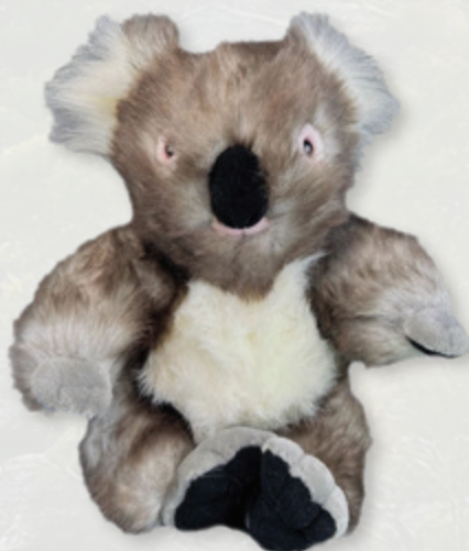
Wilber (Koala, 28cm sitting)