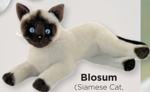
Blossum (Siamese Cat, 30cm lying)