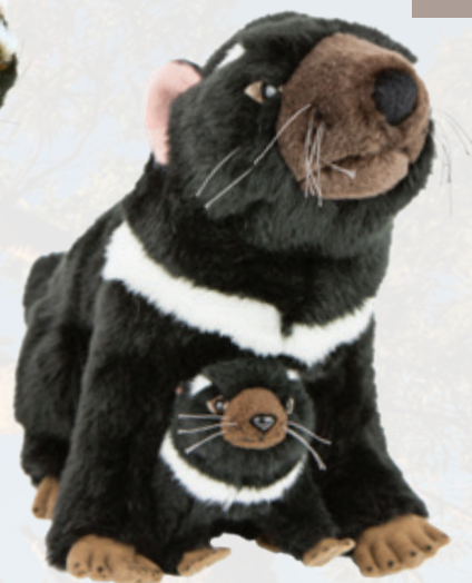
Ebony & Zippy