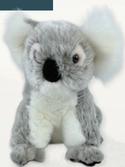
Petal (Koala, 18cm sitting)