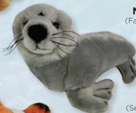
Mumble (Fairy Penguin, 27cm)