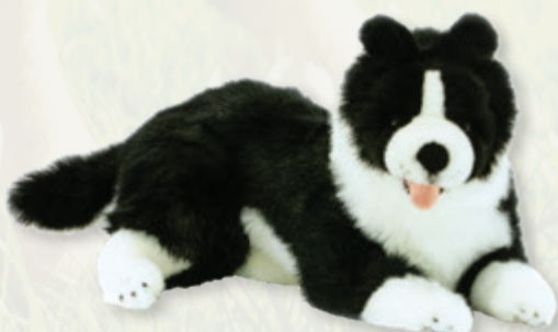
Starsky (Border Collie, 40cm lying)