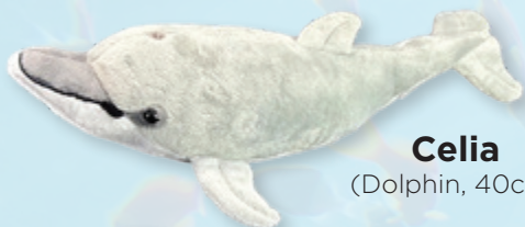
Celia (Dolphin, 40cm)