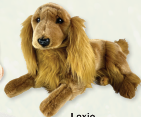
Lexie (Cocker Spaniel, 40cm lying)