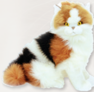
Alfio (Calico Cat, 34cm sitting)