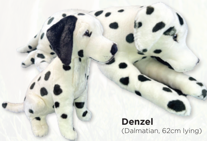
Denzel (Dalmatian, 62cm lying)