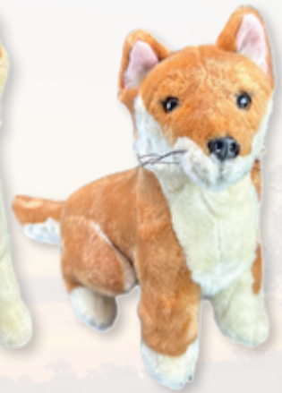
Byron (Dingo, 25cm sitting)