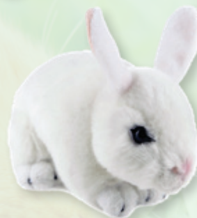
Cotton (Bunny, 25cm, white)