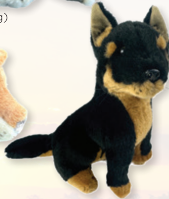
Zorro (Dingo, 18cm sitting, black)