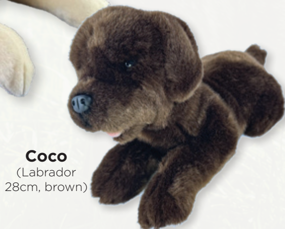
Coco (Labrador 28cm, brown)