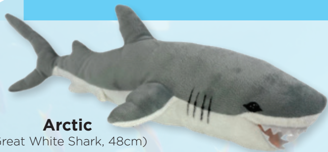
Arctic (Great White Shark, 48cm)