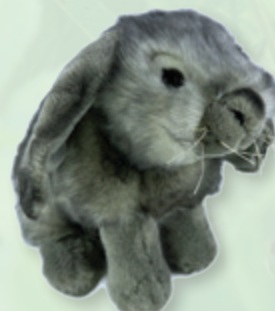
Smokey (Lop Eared Rabbit, 25cm, grey)