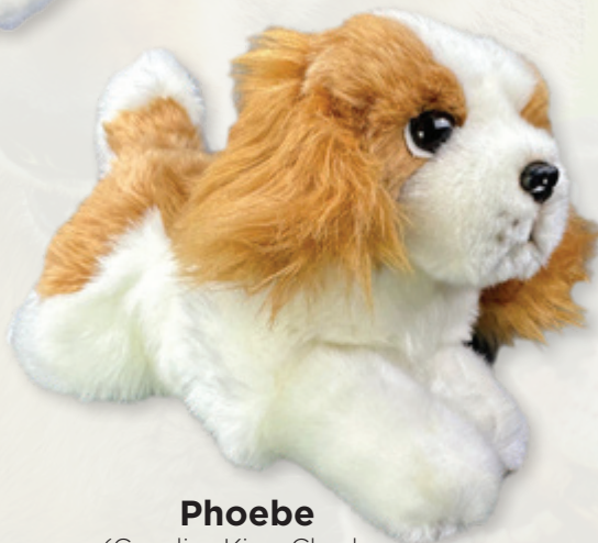
Phoebe (Cavalier King Charles, 28cm, brown)