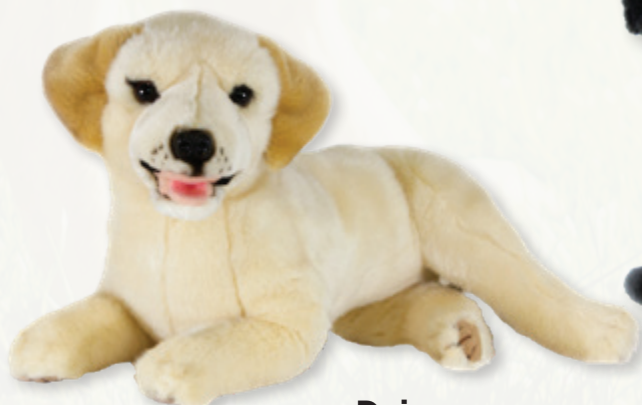
Daisy (Labrador, 38cm, cream)