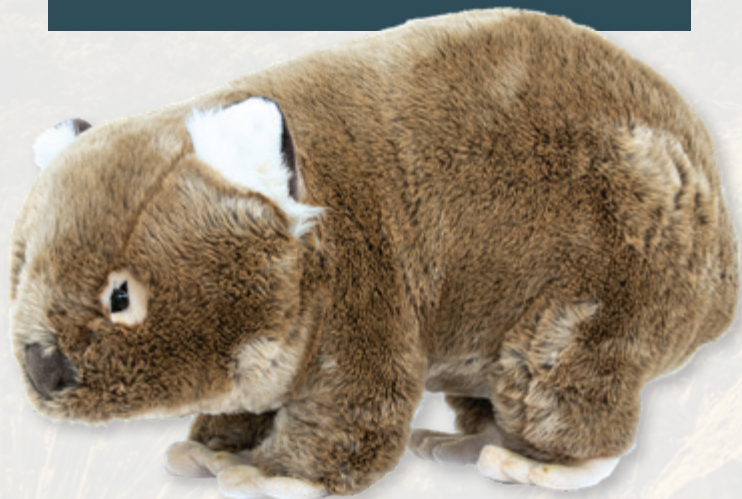
Digger (Giant Wombat, 55cm)