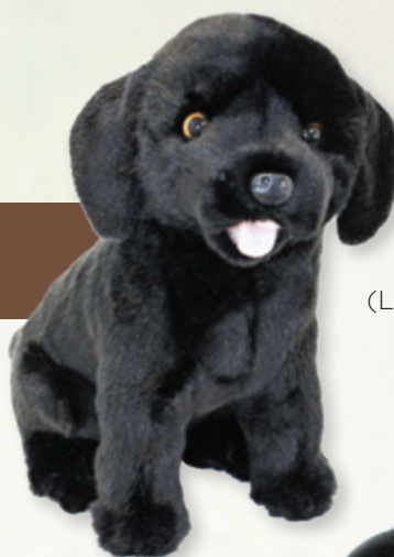
Darth (Labrador, 28cm, black)