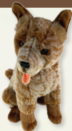
Copper (Cattle Dog, 41cm red)