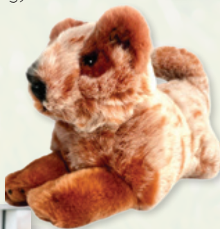
Flame (Cattle Dog, 28cm red)