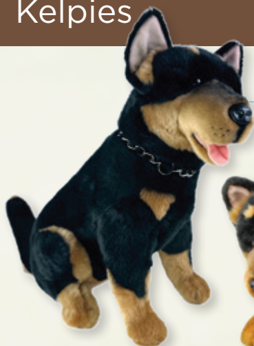
Jake (Kelpie, 38cm sitting, black & tan)