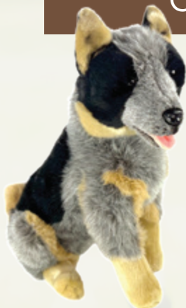
Rocky (Cattle Dog, 41cm sitting)