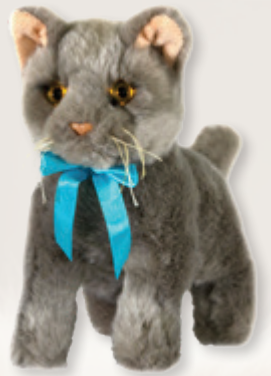
Sasha (Kitten Russian Blue, 22cm floppy)