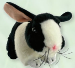
Flopsy (Bunny, 25cm, black & white)