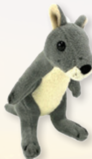
Mini Grey Kangaroo