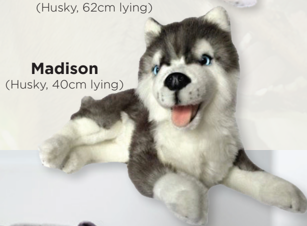
Madison (Husky, 40cm lying)