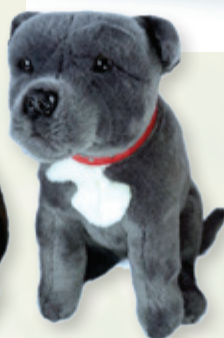
Storm (32cm sitting, grey)