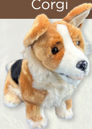
Windsor (Corgi, 23cm sitting)