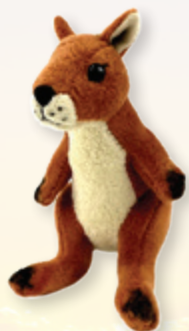
Mini Red Kangaroo