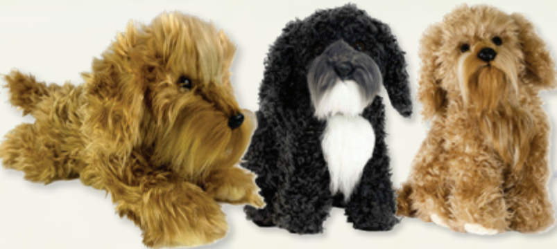
Pluto (Oodle, 28cm, floppy, brown)