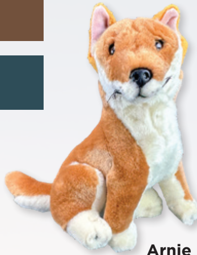
Arnie (Dingo, 18cm sitting)