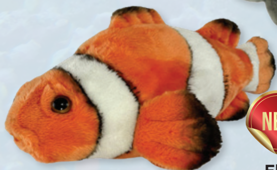
Flip (Clownfish, 22cm)