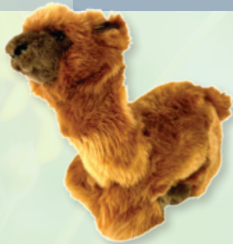
Alcapone (Alpaca, 25cm lying, brown)