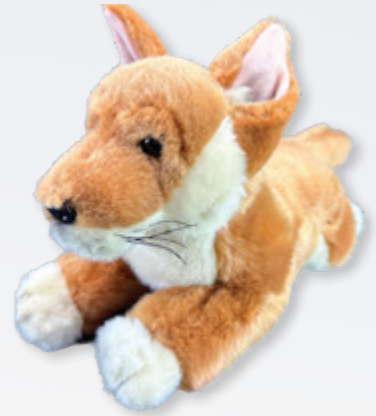
Max (Dingo, 33cm floppy)