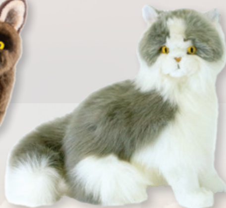
Missy (Norwegian Grey Cat, 34cm sitting)