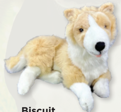
Biscuit (Border Collie, 40cm, tan)