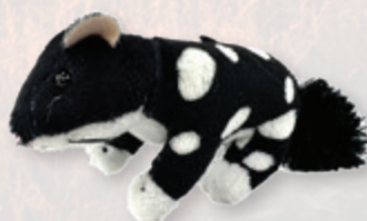
Mini Black Quoll