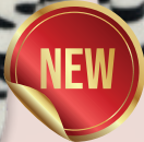
Zara (Zebra, 25cm)