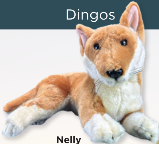
Nelly (Dingo, 40cm lying)