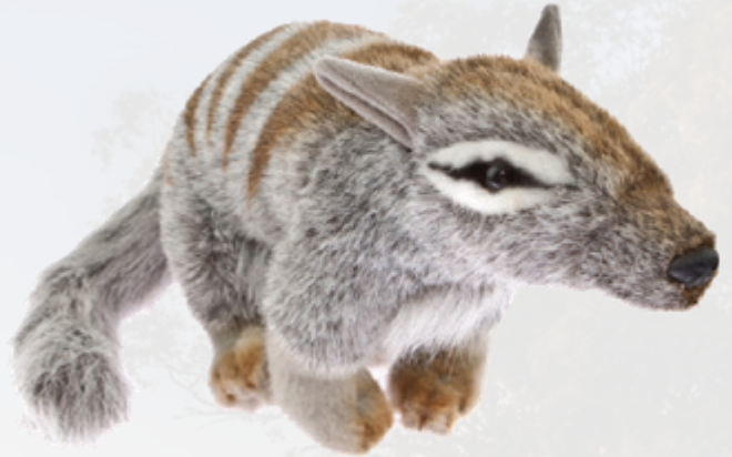
Sherbet (Numbat, 30cm standing)