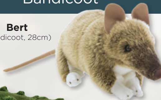
Bert (Bandicoot, 28cm)