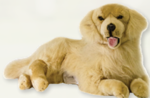
Luna (Golden Retriever, 62cm)