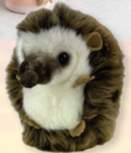
Marvin (Baby Hedgehog, 13cm)