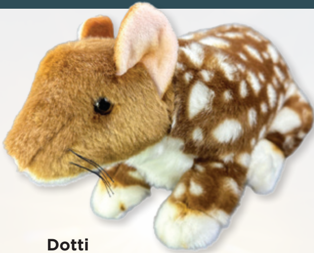
Dotti (Eastern Quoll, 30cm)