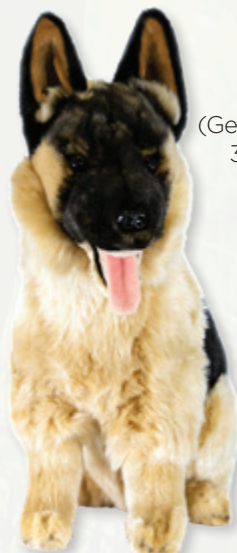
Major (German Shepherd, 38cm, sitting)