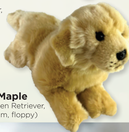
Maple (Golden Retriever, 28cm, floppy)