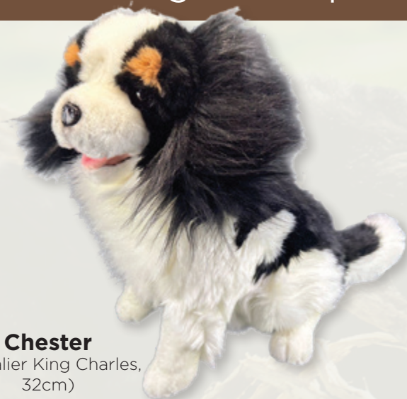
Chester (Cavalier King Charles, 32cm)