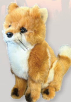
Reynard (Fox, 24cm sitting)