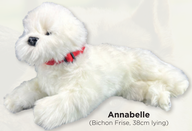
Annabelle (Bichon Frise, 38cm lying)