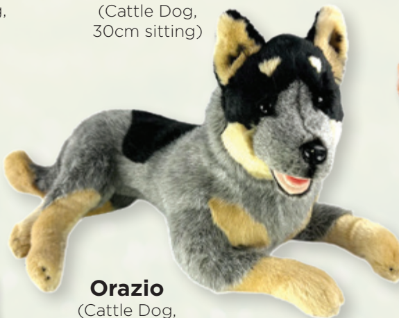
Orazio (Cattle Dog, 62cm lying)