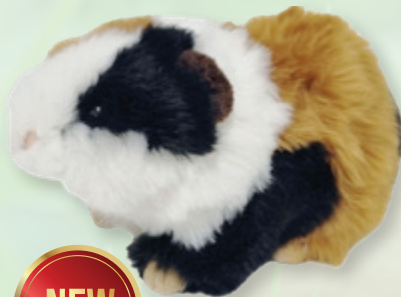
Mocca (Guinea Pig, 23cm)