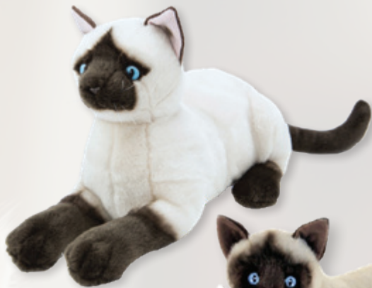
Amelia (Siamese Cat, 35cm crouching)