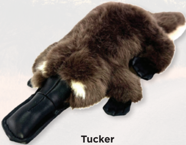
Tucker (Platypus, 38cm)