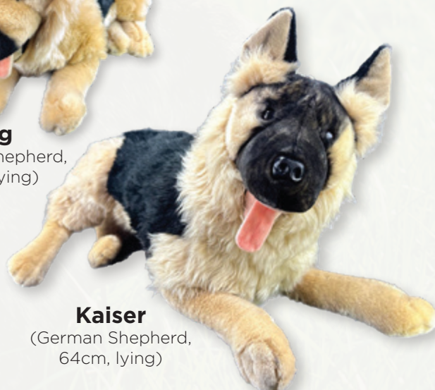
Kaiser (German Shepherd, 64cm, lying)