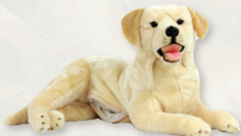
Bella (Labrador, 62cm)