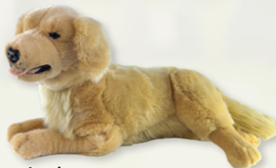
Lucky (Golden Retriever, 50cm, lying)