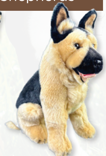
Sargeant (German Shepherd, 30cm)