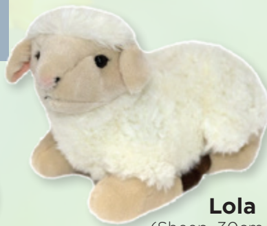
Lola (Sheep, 30cm lying)