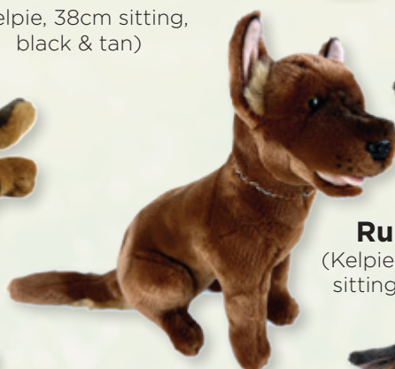
Ruby (Kelpie, 28cm sitting, red)