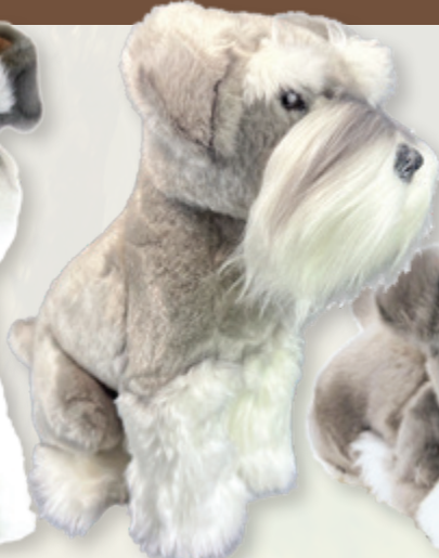
Watson (Schnauzer, 35cm sitting)