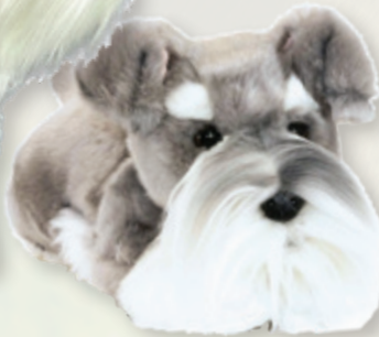
Scoobie (Schnauzer, 28cm floppy)