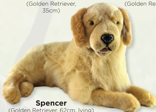
Spencer (Golden Retriever, 62cm, lying)