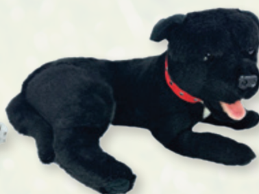
Pepper (Staffy, 35cm lying, black)