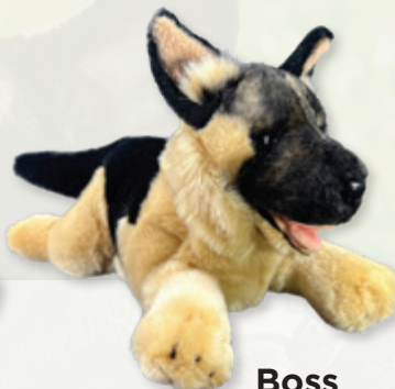
Boss (German Shepherd, 28cm)