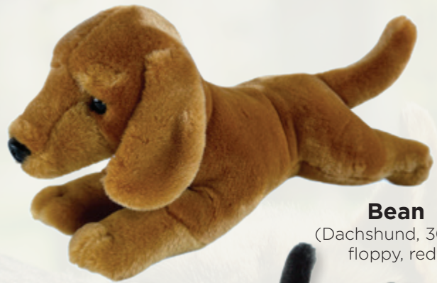
Bean (Dachshund, 30cm, floppy, red)