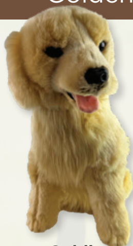
Goldie (Golden Retriever, 35cm)