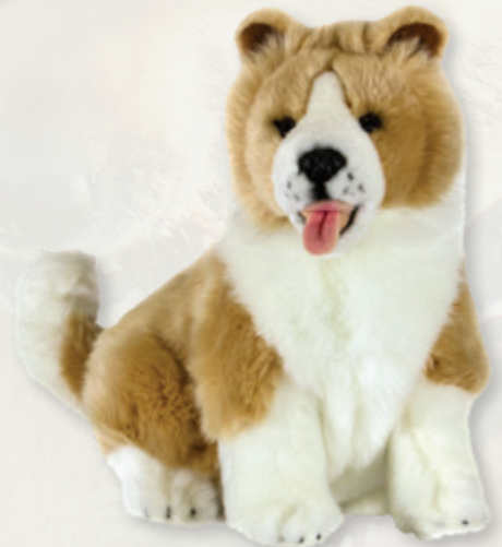
Bailey (Border Collie, 23cm, tan)