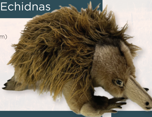
Harry (Echidna, 24cm)