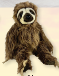
Sloe (Sloth, 57cm)