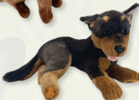
Parker (Kelpie, 40cm lying)