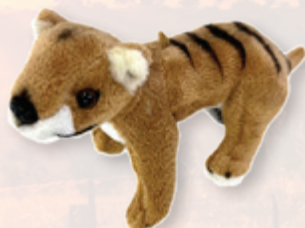
Mini Tasmanian Tiger