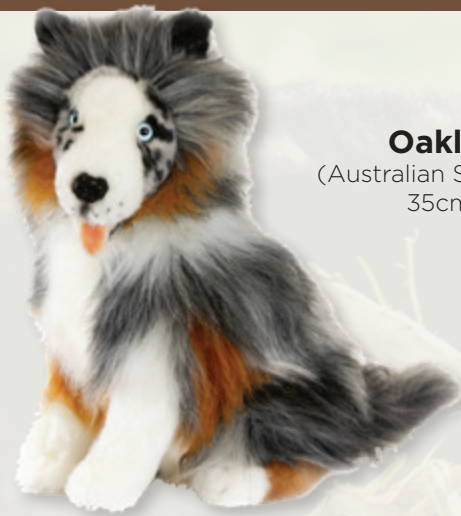
Oakley (Australian Shepherd, 35cm)