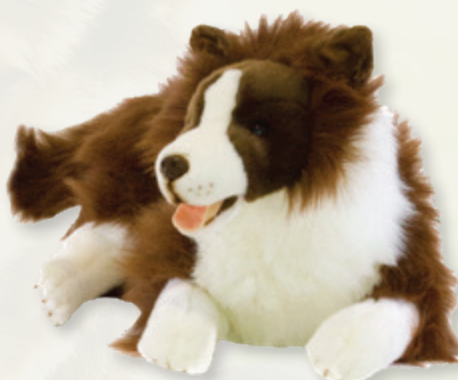
Hazel (Border Collie, 62cm)