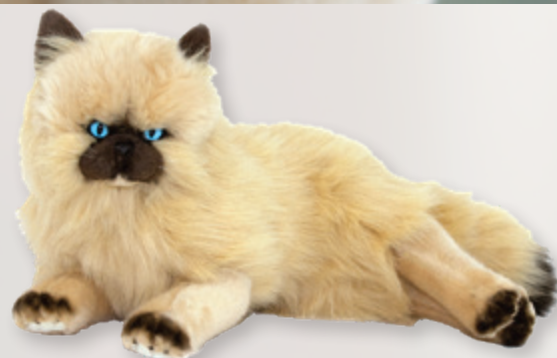
Violet (Himalayan Cat, 38cm lying)