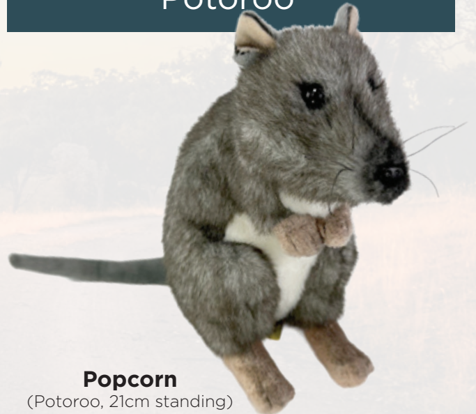
Popcorn (Potoroo, 21cm standing)