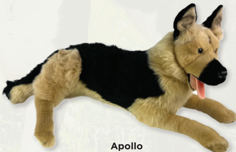
Apollo (German Shepherd, 64cm)

We are a registered NDIS supporter, so our products are generally covered by the government scheme that provides support to Australians who have a permanent and significant disability.