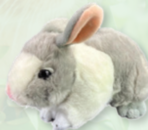
Peter (Bunny, 25cm, grey & white)