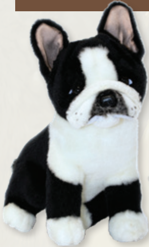
Pierre (French Bulldog, 30cm)