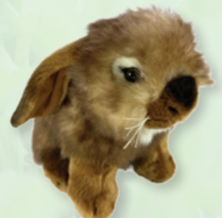
Cinnamon (Lop Eared Rabbit, 25cm)