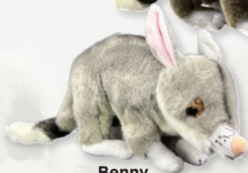
Benny (Bilby, 28cm standing)