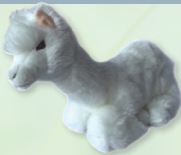
Alfredo (Alpaca, 25cm lying, white)