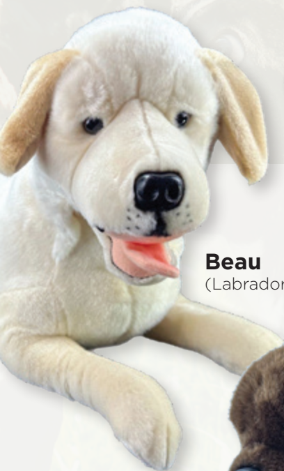
Beau (Labrador, 62cm, cream)