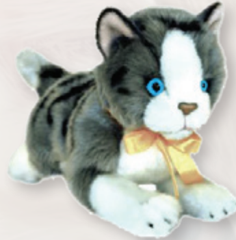
Leila (Kitten Norwegian Forest, 22cm floppy)