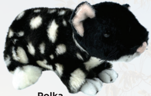
Polka (Eastern Quoll, 20cm, black)