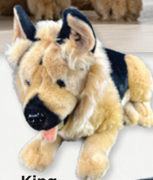
King (German Shepherd, 40cm, lying)