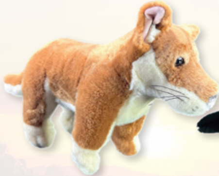
Frazer (Dingo, 25cm standing)