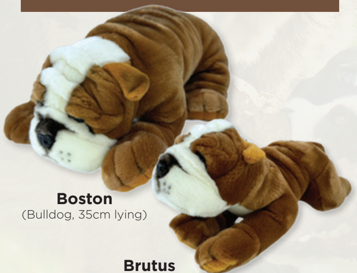
Brutus (Bulldog - 30cm floppy)