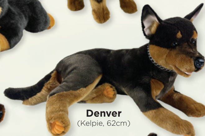
Denver (Kelpie, 62cm)