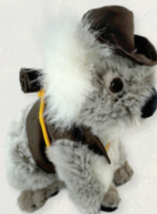
Jack (Koala with swag & hat, 12cm)