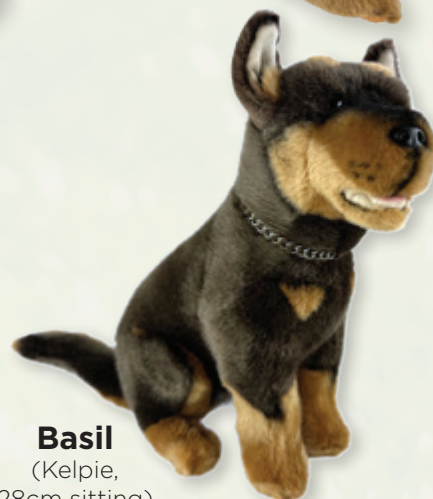
Basil (Kelpie, 28cm sitting)