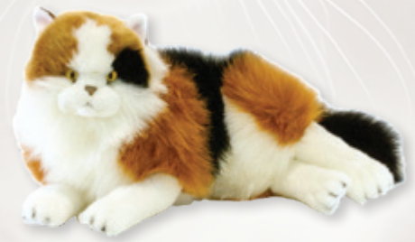
Marmalade (Calico Cat, 38cm lying)