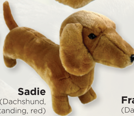
Sadie (Dachshund, 36cm, standing, red)