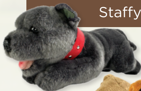
Bullet (Staffy - 28cm floppy, grey)