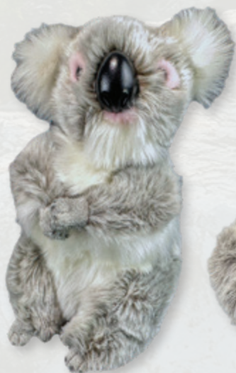
Tinker (Koala, 20cm standing)