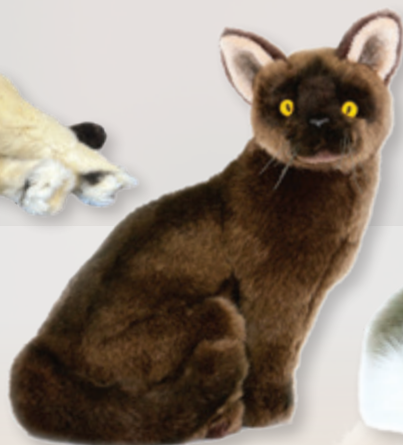
Nutmeg (Burmese Cat, 26cm, sable)