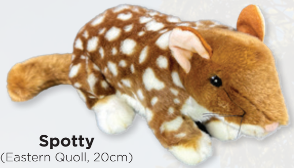
Spotty (Eastern Quoll, 20cm)