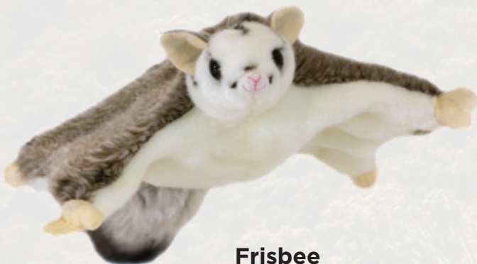
Frisbee (Squirrel Glider, 18cm)