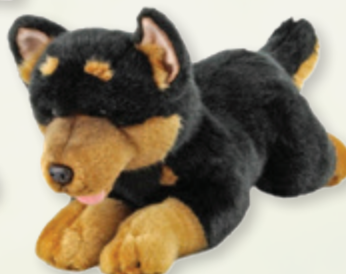
Gadget (Kelpie, 28cm, black & tan)