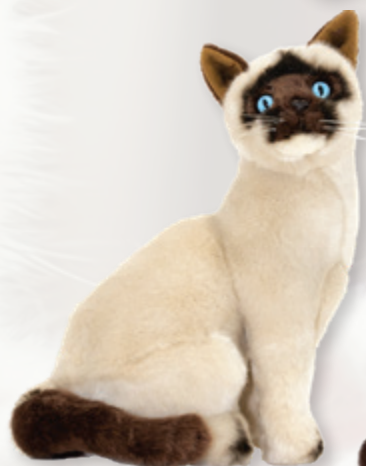
Noodles (Siamese Cat, 26cm sitting)