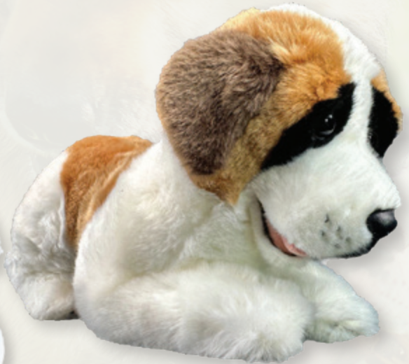
Mozart (St. Bernard, 40cm lying)