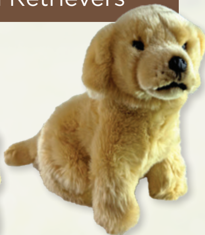
Chanel (Golden Retriever, 26cm)