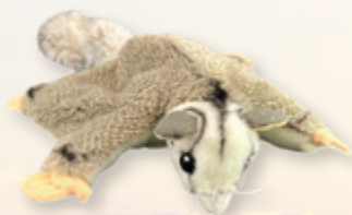
Mini Squirrel Glider