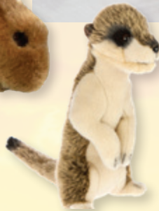
Boris (Meerkat, 26cm)