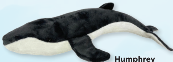
Humphrey (Humpback Whale, 48cm)