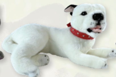
Winter (Staffy, 35cm lying, white)