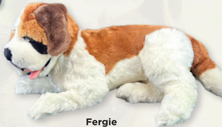
Fergie (St. Bernard, 62cm lying)