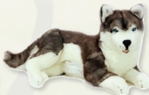
Rocket (Husky, 62cm)