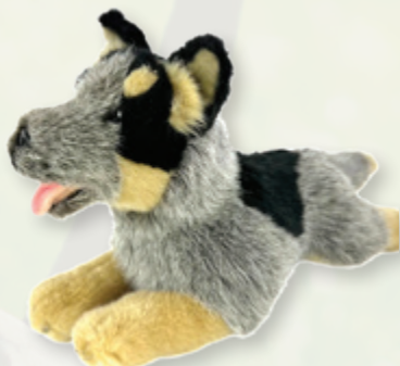
Rusty (Cattle Dog, 27cm floppy)