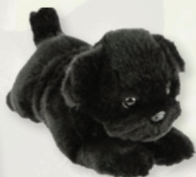
Puddles (Pug, 28cm floppy, black)