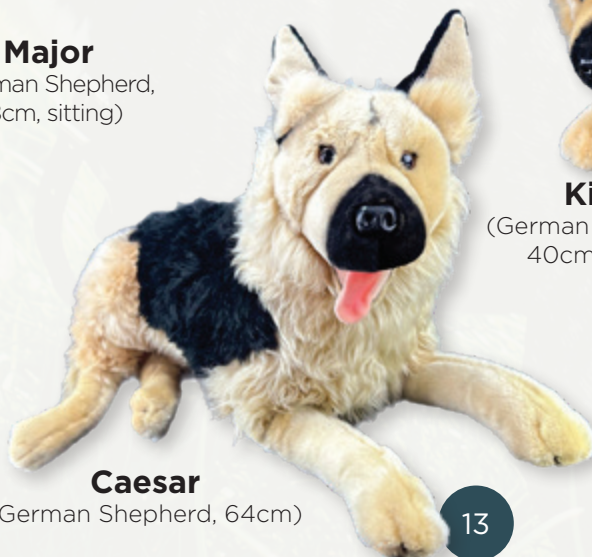
Caesar (German Shepherd, 64cm)