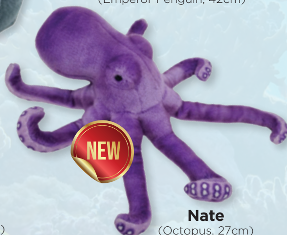
Nate (Octopus, 27cm)