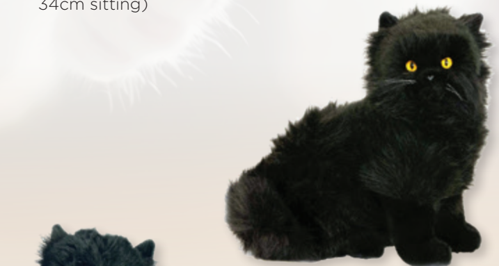
Crystal (Black Cat, 34cm sitting)