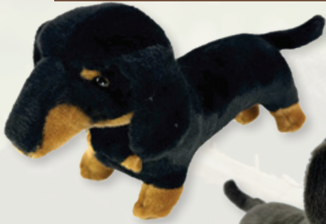
Buddy (Dachshund, black and tan, 36cm)