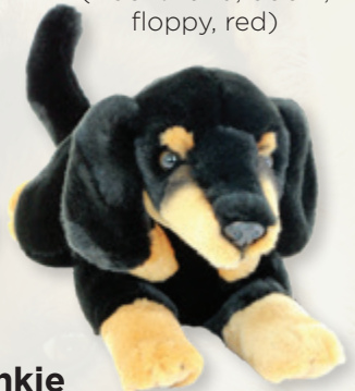
Frankie (Dachshund, black and tan 30cm)