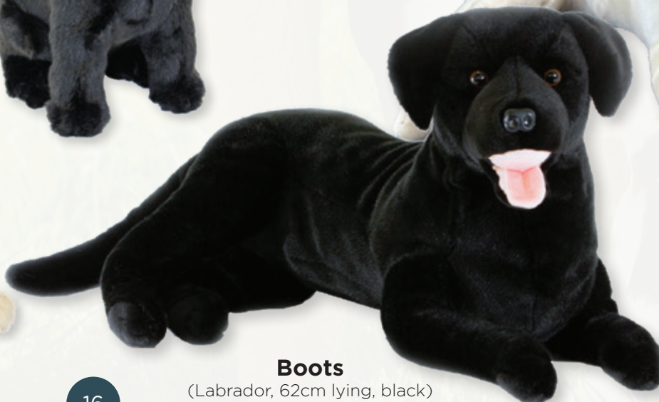
Boots (Labrador, 62cm lying, black)