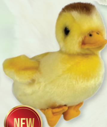
Dutchess (Duckling, 16cm)