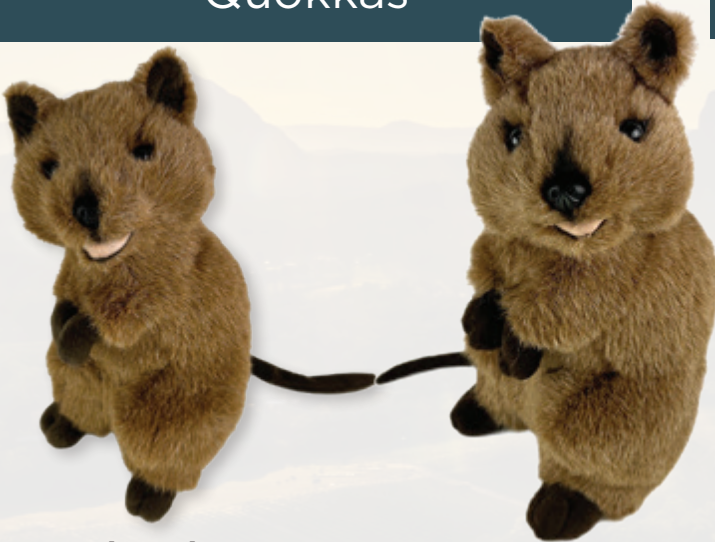
Edward (Quokka, 21cm standing)