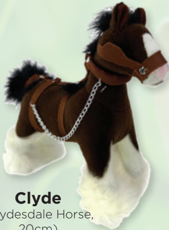
Clyde (Clydesdale Horse, 20cm)