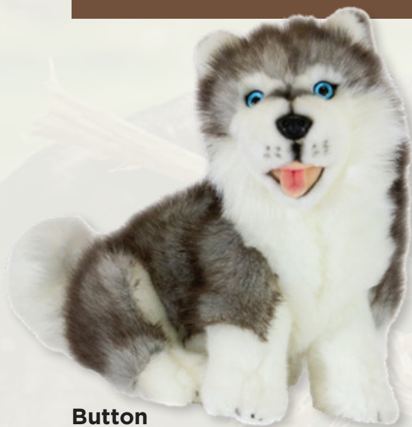
Button (Husky - 26cm sitting)