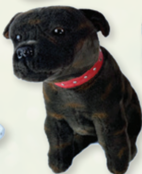
Scooter (32cm sitting, brindle)