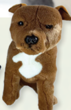
Lester (32cm sitting, brown)