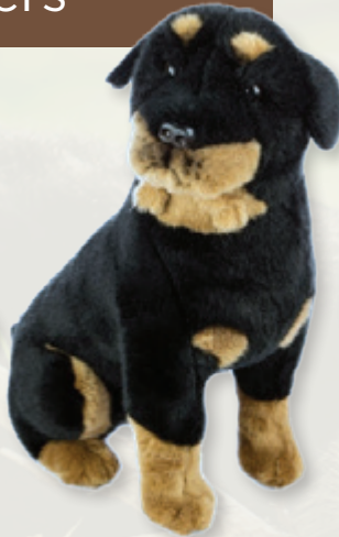
Koda (Rottweiler, 25cm sitting)