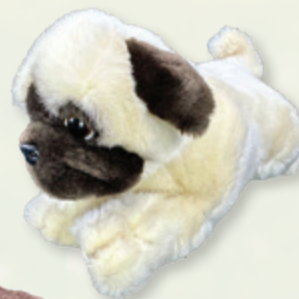
Pepito (Pug, 28cm floppy)