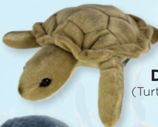
Doug (Turtle, 27cm)