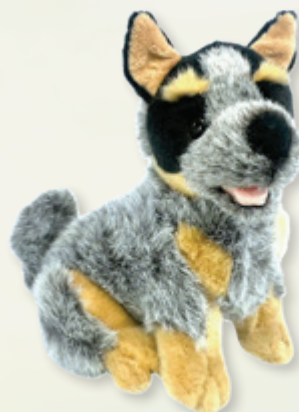
Bluey (Cattle Dog, 22cm sitting)