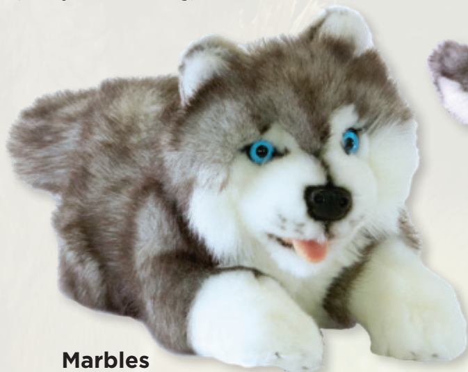
Marbles (Husky, 28cm floppy)