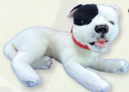
Loki (Staffy, 35cm lying, white)