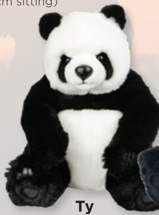
Ty (Panda Cub, 34cm)