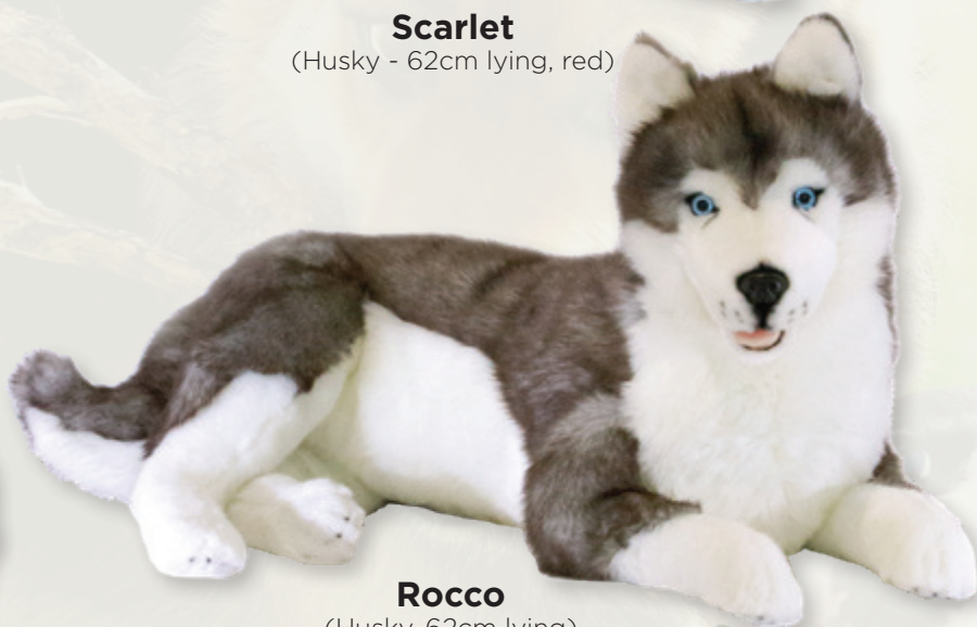
Rocco (Husky, 62cm lying)