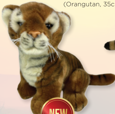
Tony (Tiger Cub, 26cm, brown)