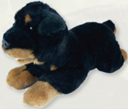
Kujo (Rottweiler, 28cm floppy)