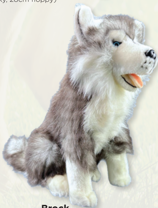
Brock (Husky, 35cm sitting)