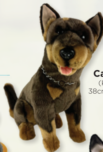
Cannon (Kelpie, 38cm sitting)