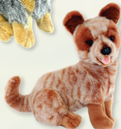
Blaze (Cattle Dog, 22cm sitting)