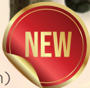
Arthur (Elephant, 27cm)