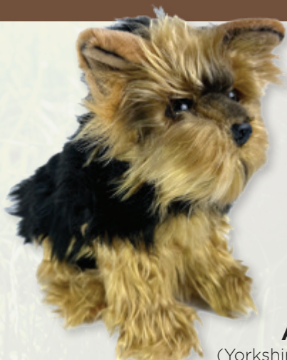
Archie (Yorkshire Terrier, 28cm)