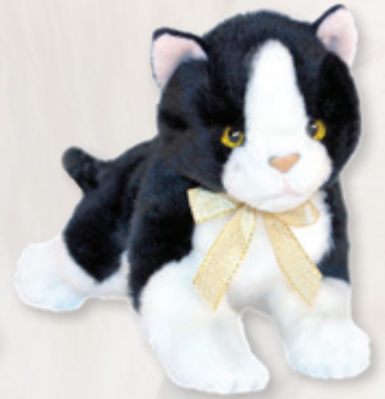
Mango (Kitten Piebald, 22cm floppy)