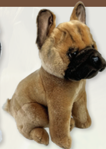
Paris (French Bulldog, 30cm brown)