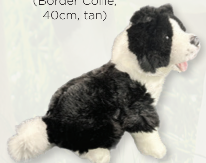
Pepsi (Border Collie, 23cm sitting)