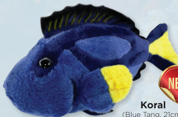
Koral (Blue Tang, 21cm)