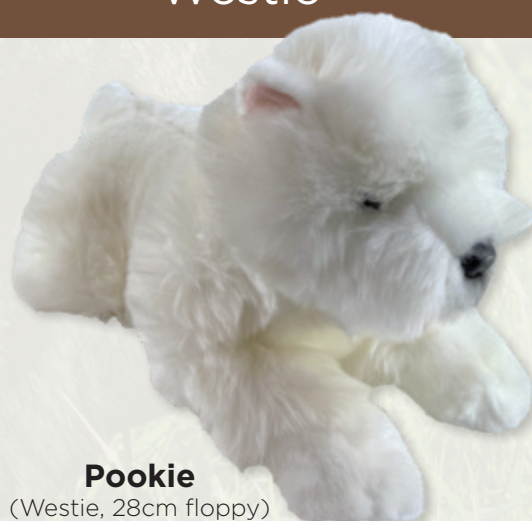
Pookie (Westie, 28cm floppy)