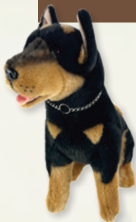
Rex (Kelpie, 28cm sitting, black and tan)