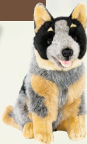
Marshall (Cattle Dog, 30cm sitting)