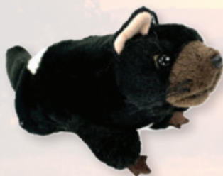
Mini Tasmanian Devil