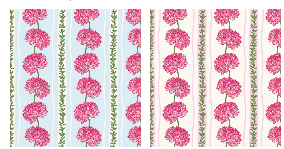
Gardens at Dusk