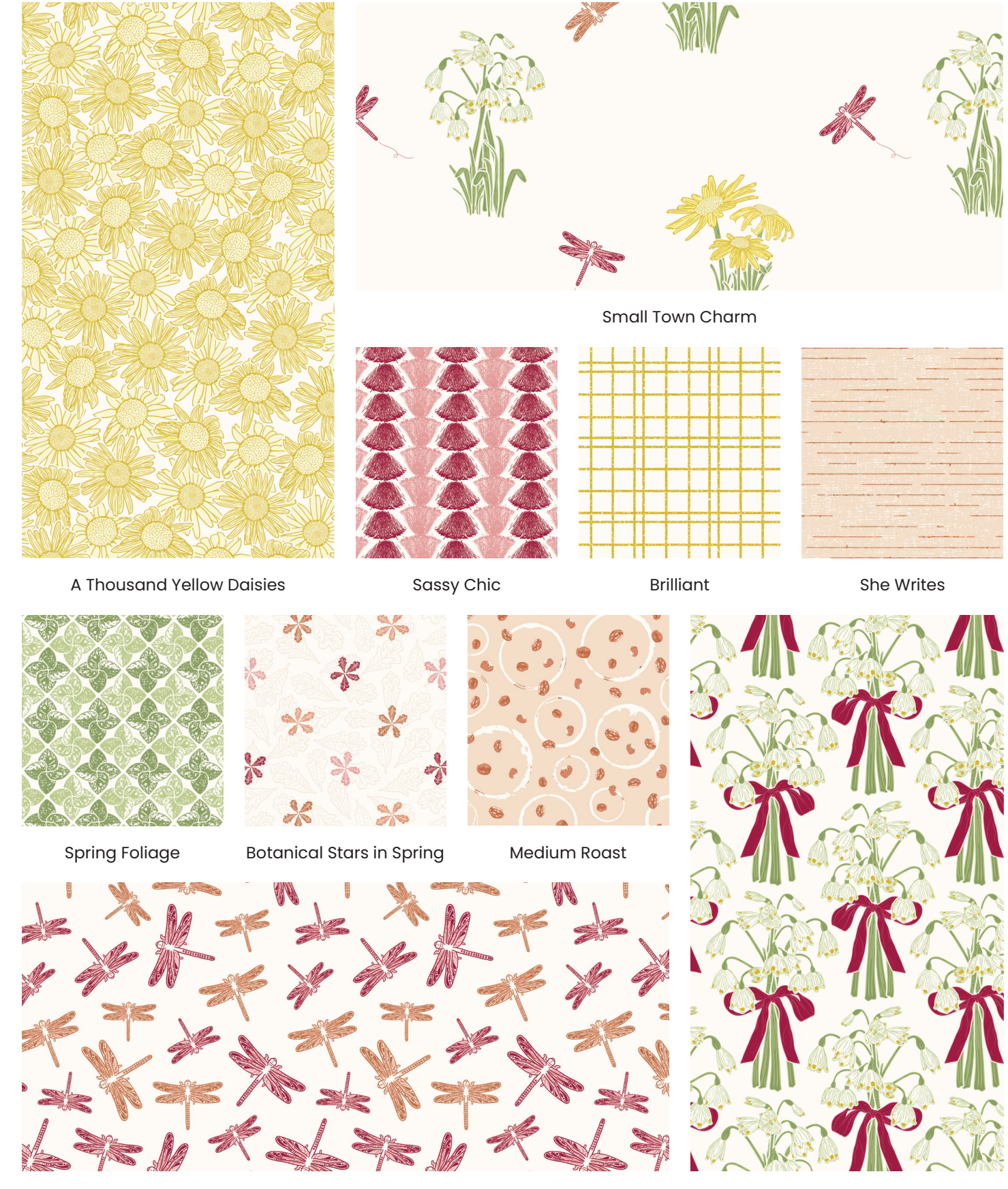
One of Their Own - Lorelei