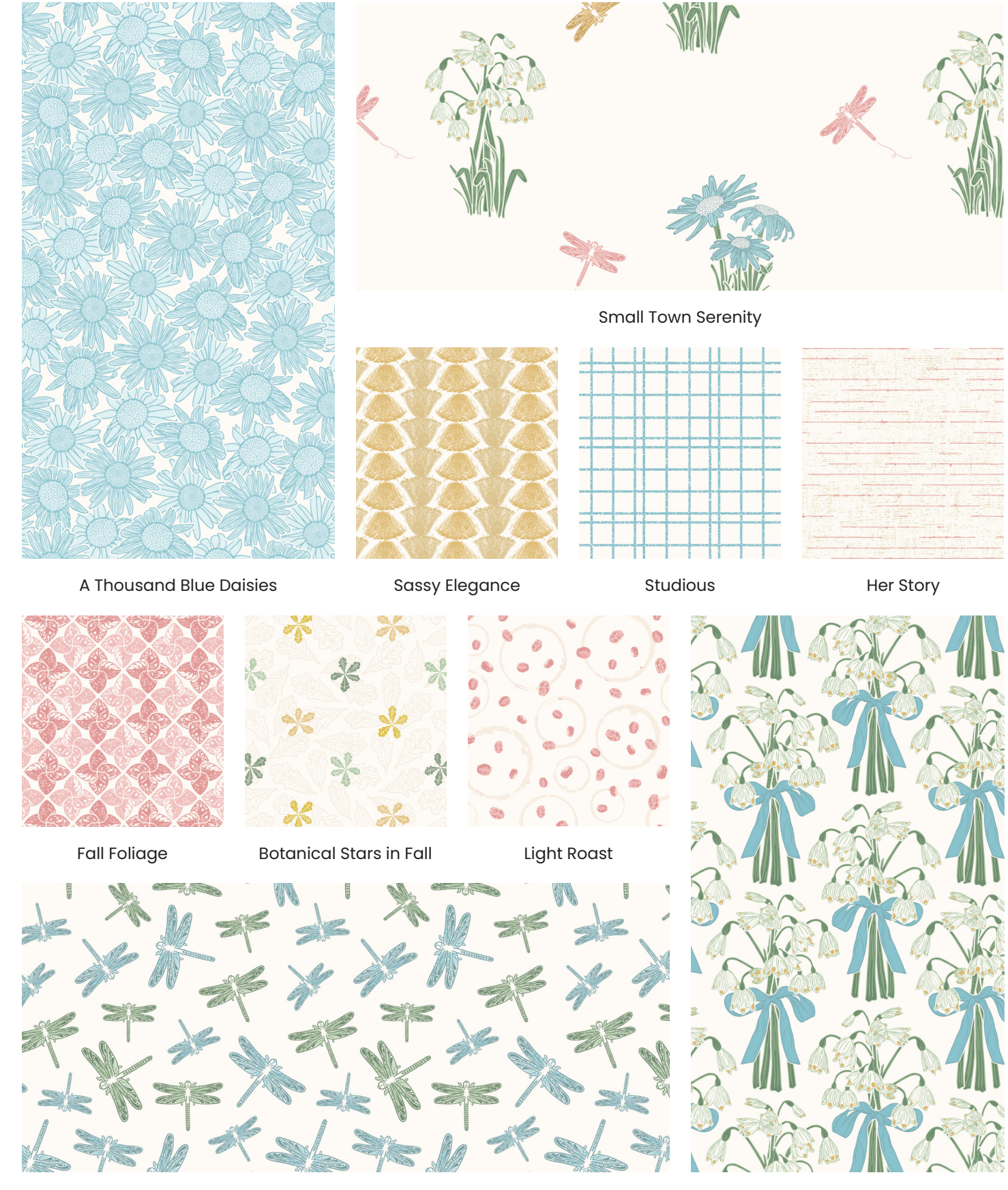
One of Their Own - Sookie